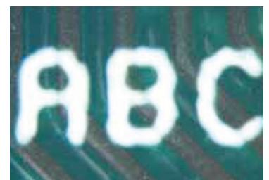
0.7mm text with DotStream Technology™ 1 pass, 26 seconds