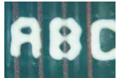
0.7mm text before DotStream Technology™ 2 passes, 58 seconds